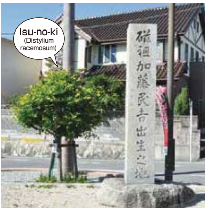
Isu-no-ki (Distylium racemosum)